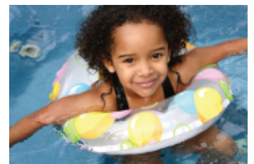
Watch for our community pool facility opening summer 2009.

heritage. An evolving, progressive community with a vibrant downtown of more than 100 businesses, including outstanding restaurants, specialty shops, and an officially registered historic district, Wake Forest newcomers and long-time residents alike with incomparable warmth and charm. But don't let downtown's quaintness fool you. The surrounding area also offers some of the newest and best shopping